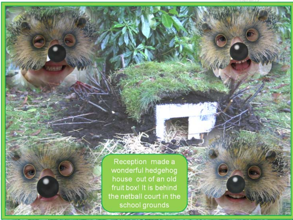
Reception made a wonderful hedgehog house out of an old fruit box! It is behind the netball court in the school grounds

Moorfield v Fulneck 1/2/2012 U11 1-6 to Fulneck U10 9-0 to Moorfield