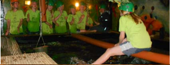
A challenging and fun 3 days at Robinwood for S5 and S6!